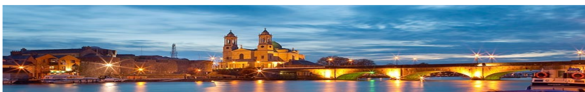
Athlone: ESAI Conference venue 2014

Further details on our conference theme are on the ESAI website: www.esai.ie/conference-2014-call