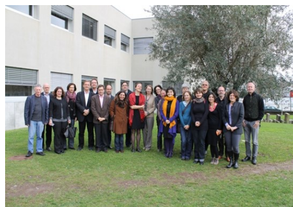
EERA Council Members, University of Porto, January 18 th 2014.

1 st September, and we urge all emerging researchers involved in Educational Research on the island of Ireland to attend. This is an excellent networking opportunity, and the conference fee is very reasonable and there are also a number of bursaries available (for further detail on bursaries see http://www.eera-ecer.de/ecer2014/emerging-researchers-conference/ )